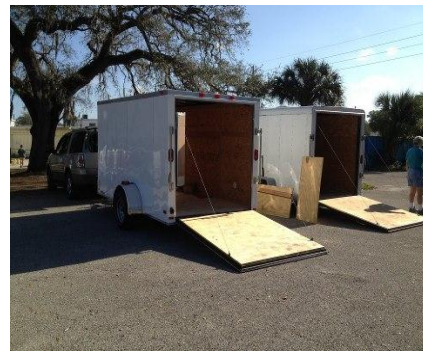
Into the new...