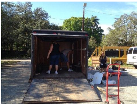
Out of the old...

NEW! Our new trailers are ready to roll to Punta Gorda. A work crew gathered last Sunday to unload, check out, and reload equipment into the two new trailers.